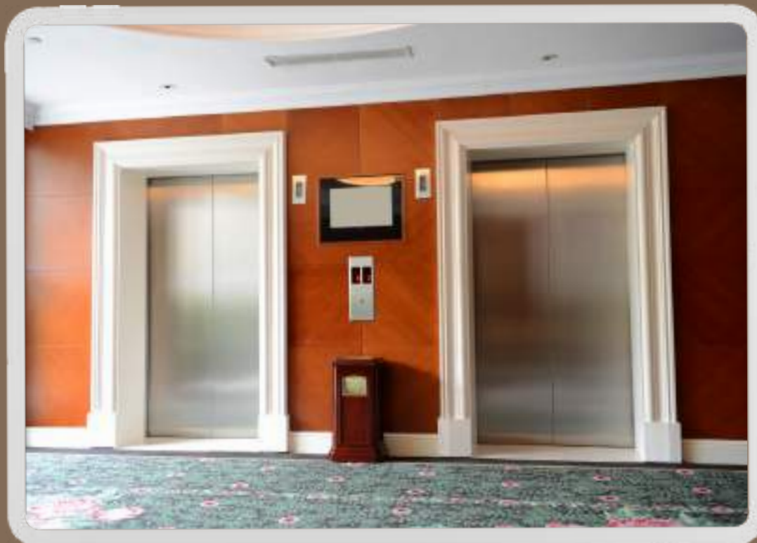
HIGH SPEED LIFT