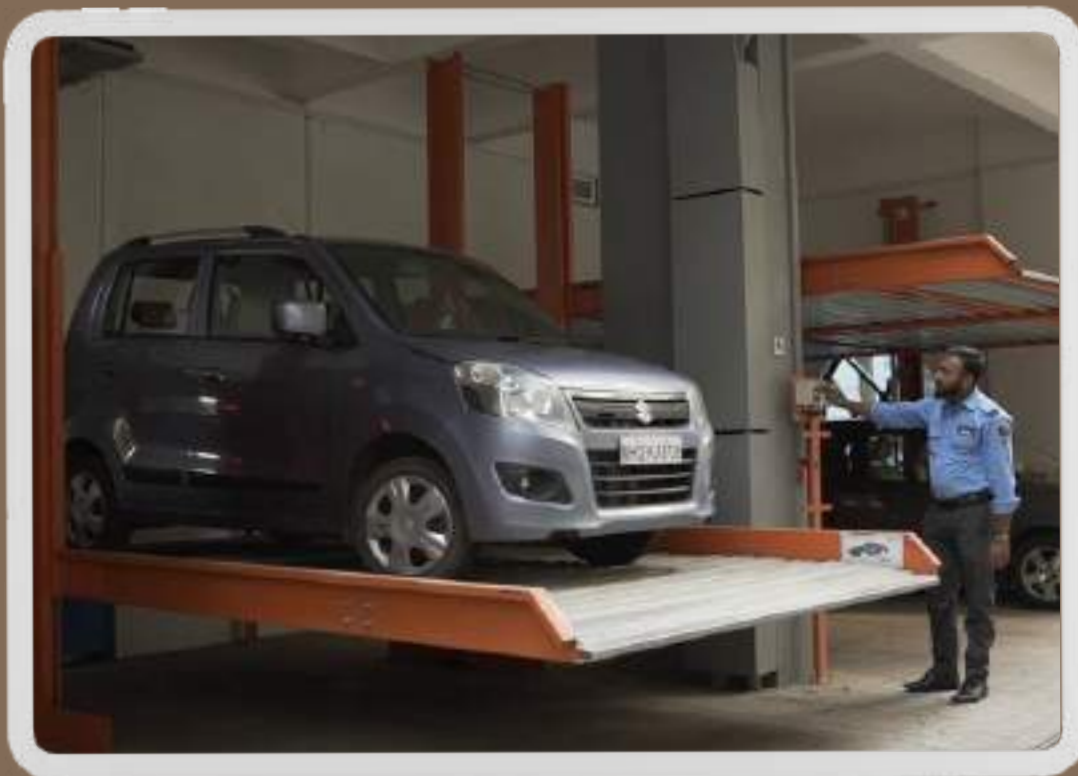
STACK / STILT PARKING