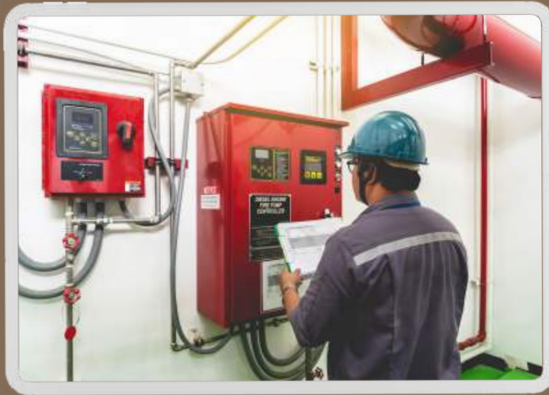
FIRE FIGHTING SYSTEM