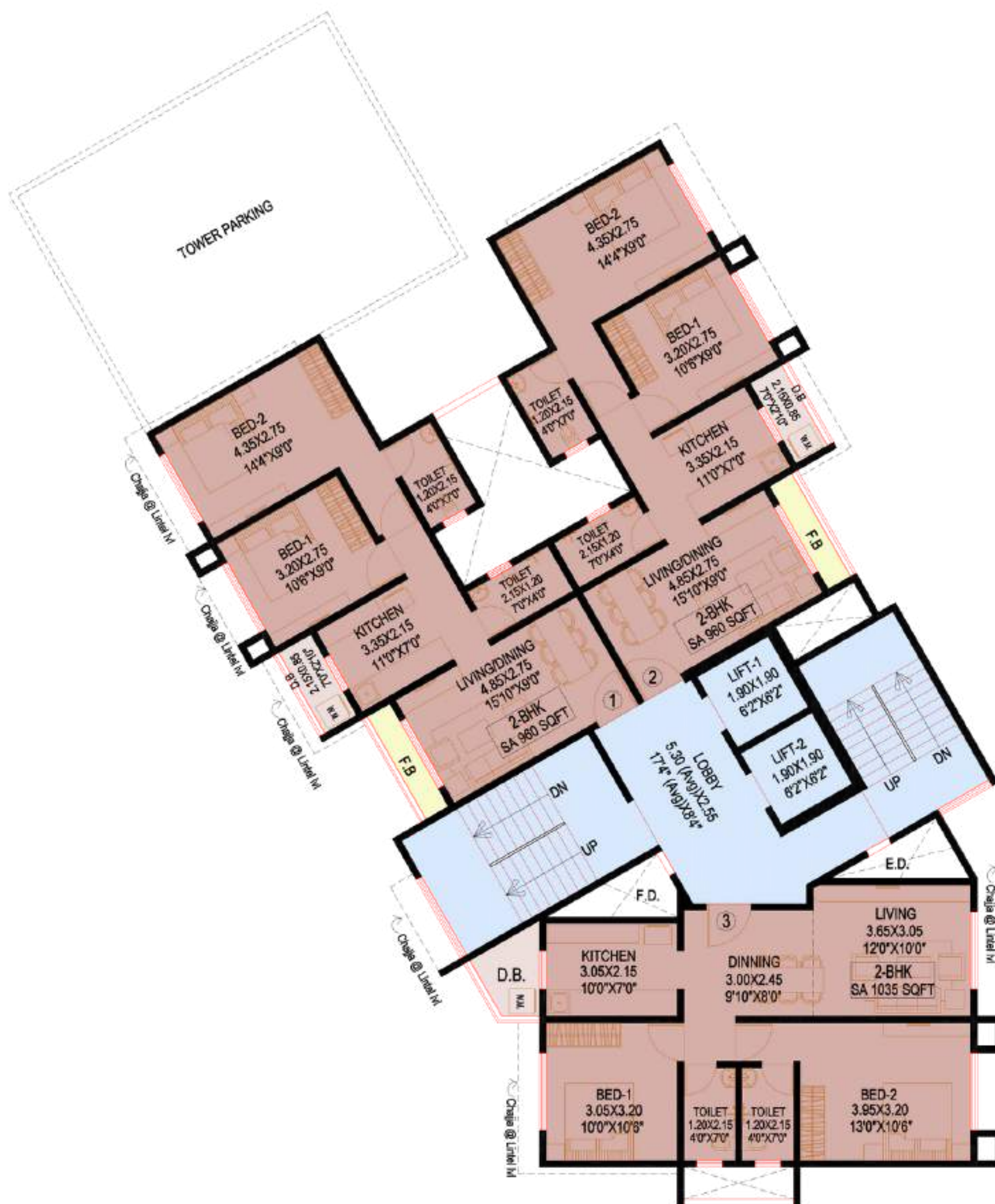
TYPICAL FLOOR PLAN (1ST TO 7TH, 9TH TO 12TH, 14TH TO 17TH & 19TH TO 23RD)