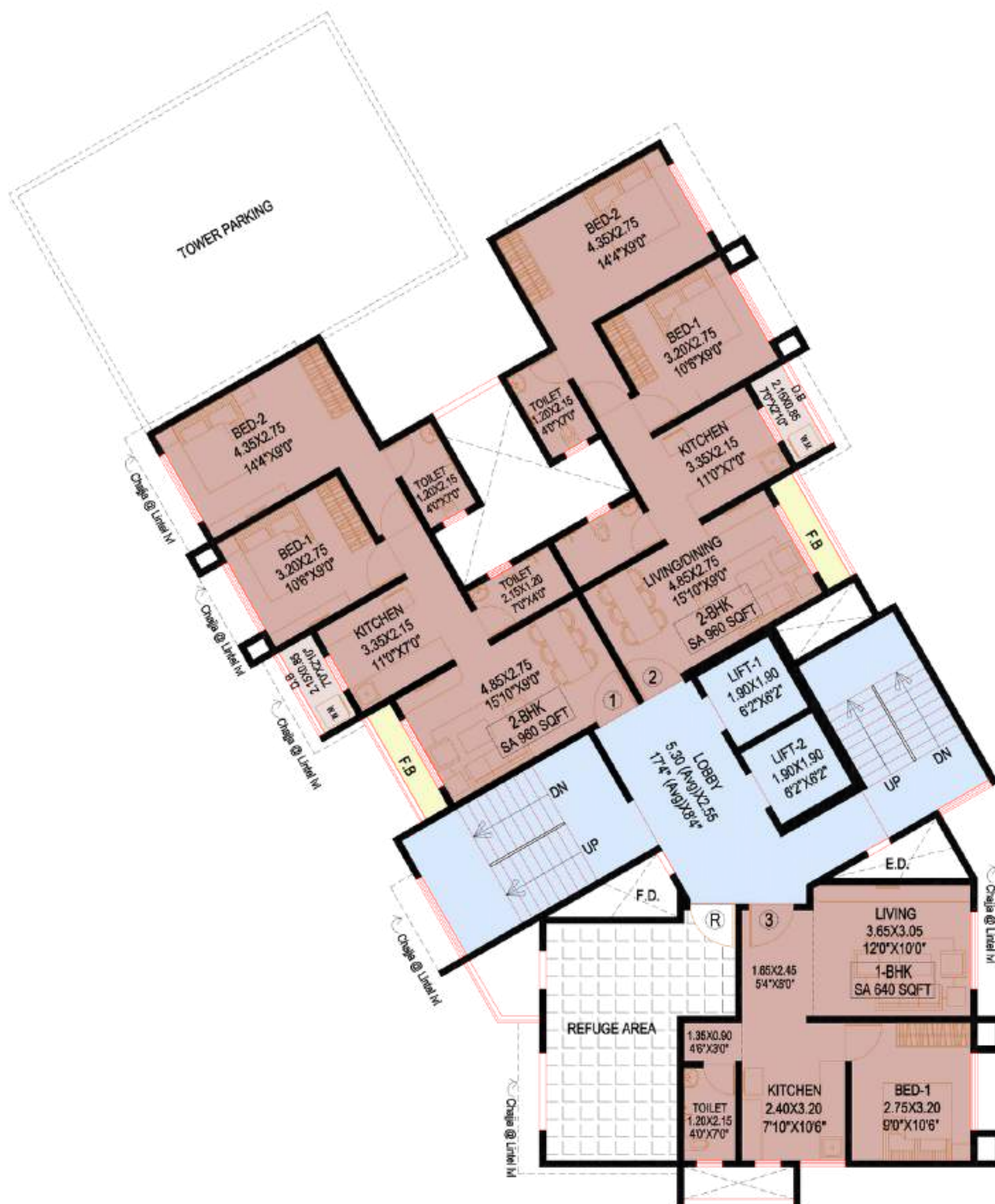
8TH, 13TH & 18TH FLOOR PLAN